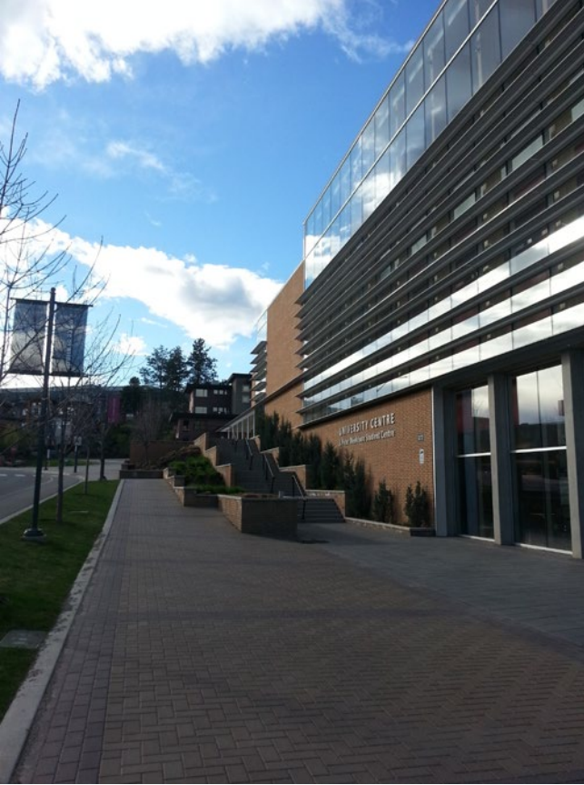
UBCO University Centre